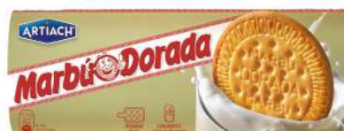
MARBÚ DORADA 200 GR