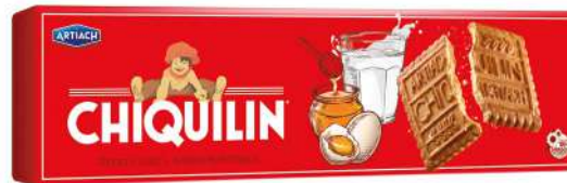
CHIQUILIN 175 GR