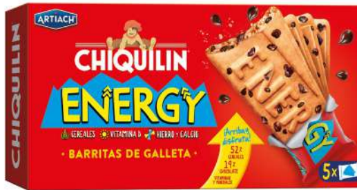
CHIQUILIN ENERGY 150 GR