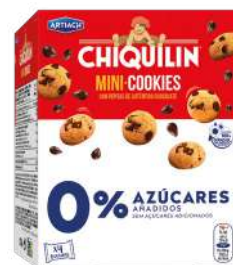
CHIQUILIN 0% MINI COOKIES 120 GR