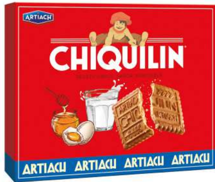
CHIQUILIN 525 GR