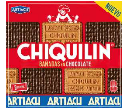
CHIQUILIN COATED WITH CHOCOLATE 200 GR