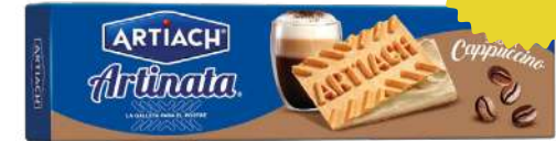
ARTICAPUCCINO WAFER 210 GR