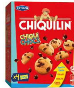
CHIQUILIN ENERGY CHIQUICHOCOS 140 GR