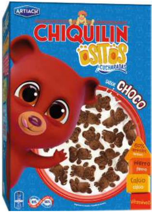
CHIQUILIN MINI BEARS CHOCOLATE 320 GR