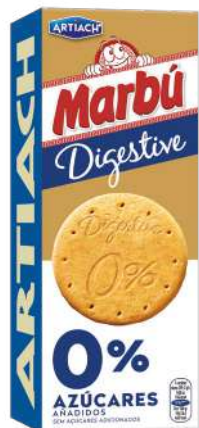
MARBÚ 0% DIGESTIVE 400 GR