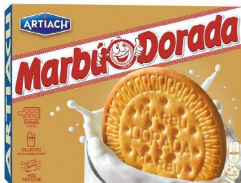
MARBÚ DORADA 600 GR