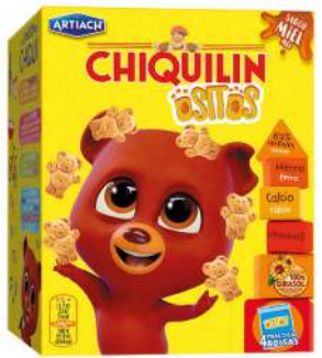
CHIQUILIN MINI BEARS HONEY 160 GR