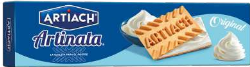
ARTICREAM WAFER 210 GR