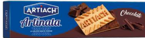
ARTICHOCO WAFER 210 GR