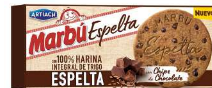
MARBÚ SPELT CHOCOLATE CHIPS 225 GR