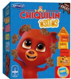
CHIQUILIN MINI BEARS CHOCOLATE 160 GR