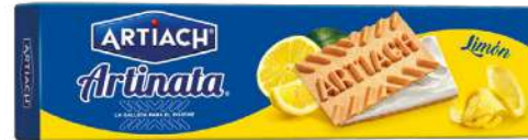
ARTILEMON WAFER 210 GR